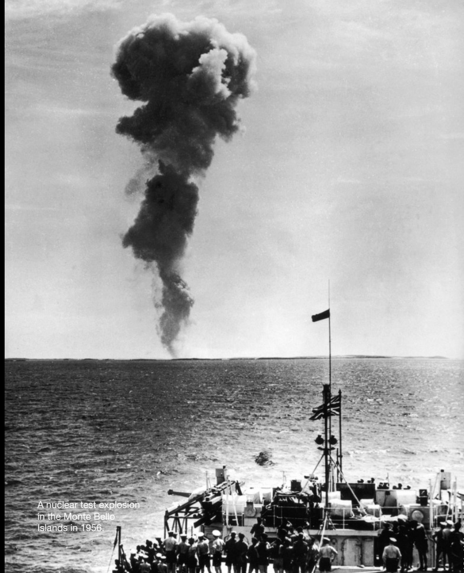
A nuclear test explosion in the Monte Bello Islands in 1956.