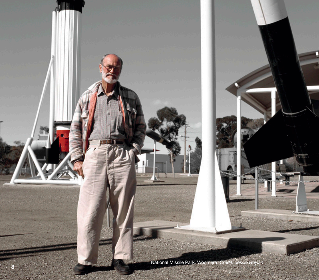
National Missile Park, Woomera.