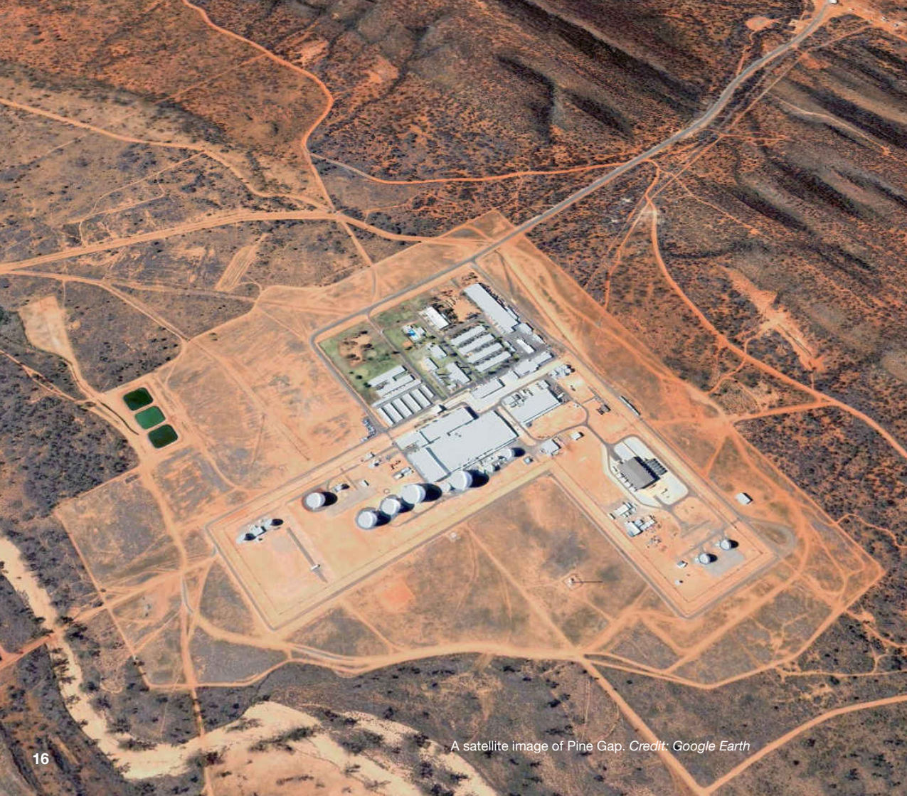
A satellite image of Pine Gap.